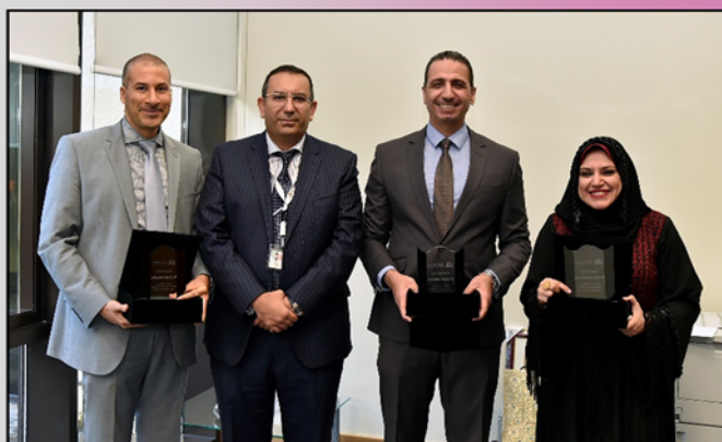
Faculty members during the Award ceremony